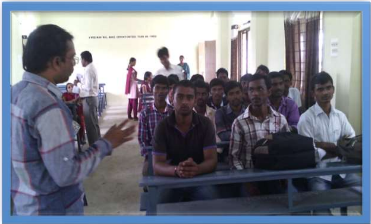
JKC Job Drive selected Students with JKC Staff – Drive conducted on 19.09.2014 at D.S.GDC(W),Ongole