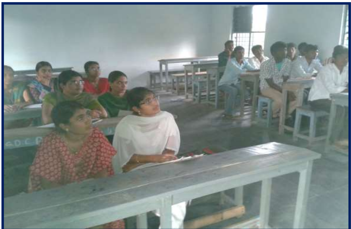
JKC Grand Test for Batch I & Batch II Students on 31.10.2014