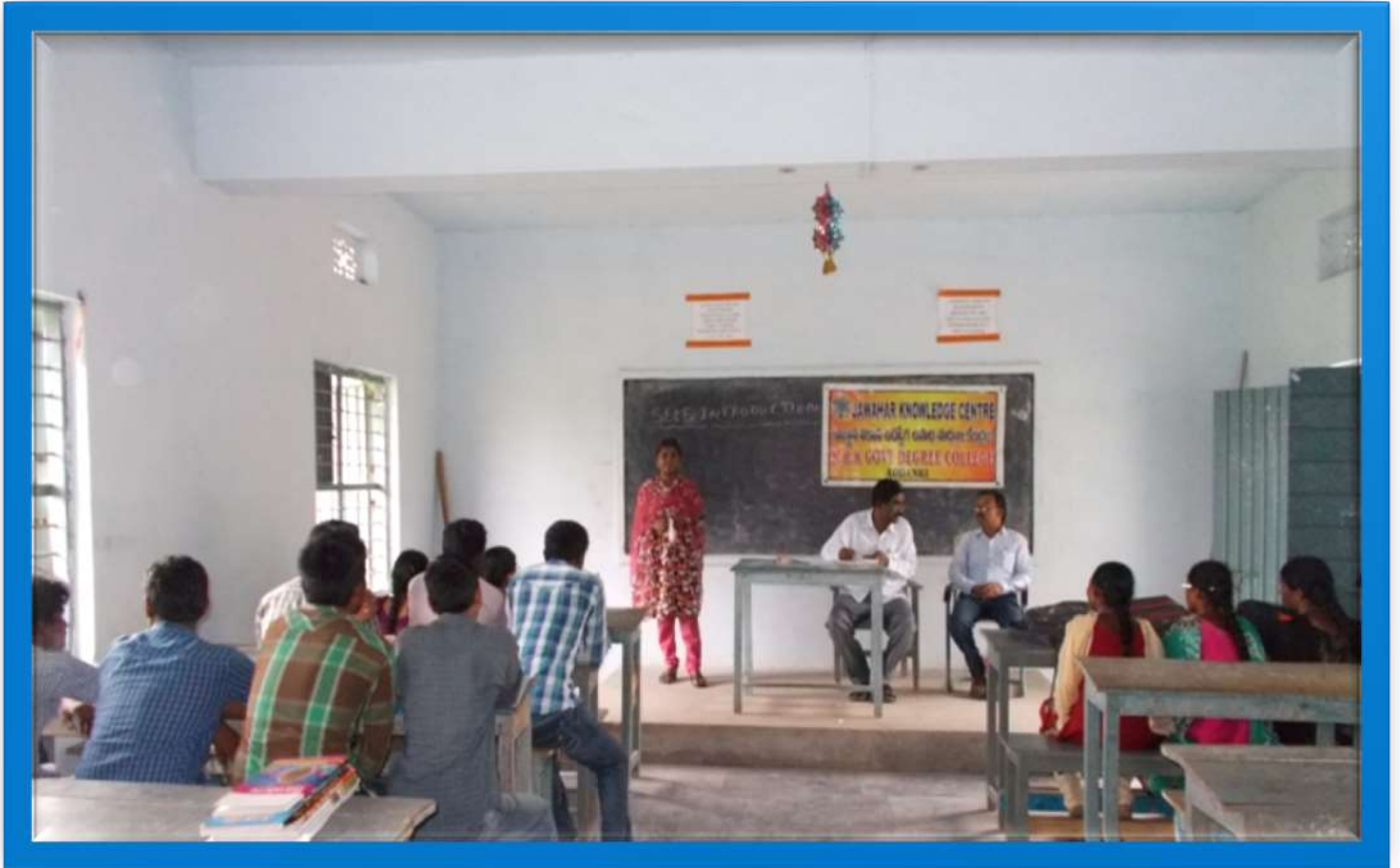
JKC Batch II Students News Paper Reading Programme