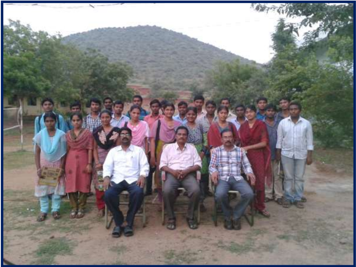
Seminar on " Cadbury India Foods Ltd.," Job Drive to be conducted at GDC(W),Chirala Dt:14.11.2014